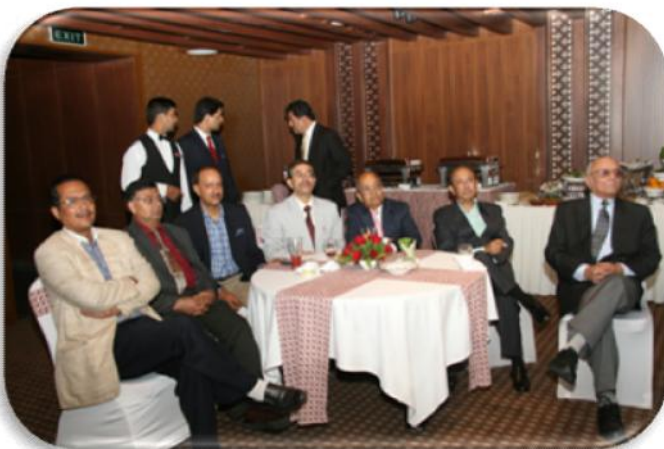
NICCI Past President/Former Nepalese Envoy to India and Distinguished Guests in the program