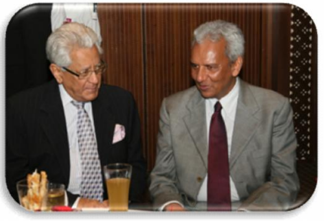
His Excellency with Founding President, CNI President, NICCI Office Bearers and Distinguished Guests in the program