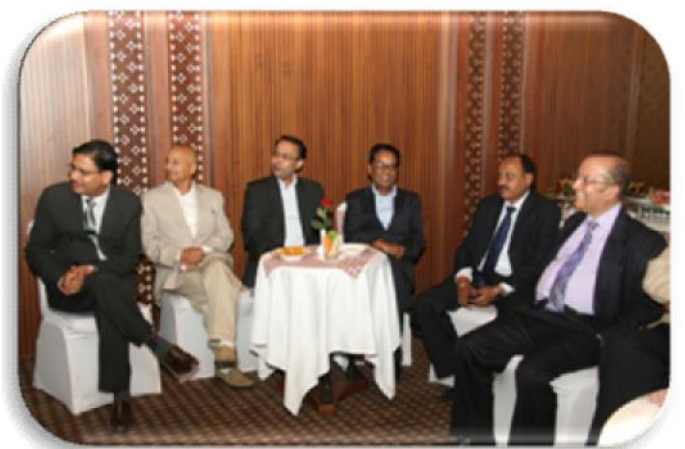
NICCI Office Bearers and Distinguished Guests in the program